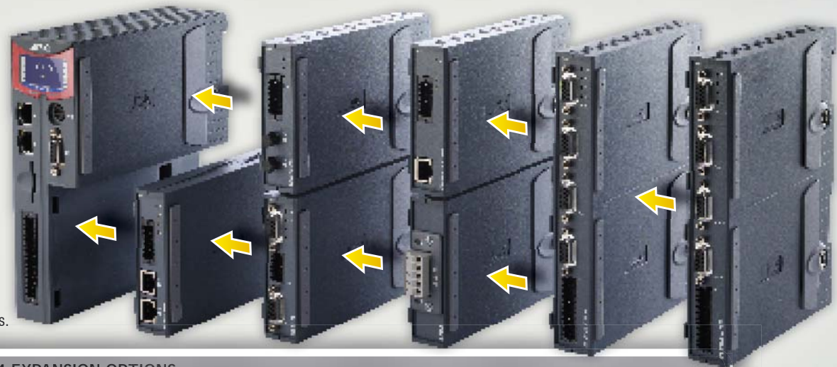
MC664 EXPANSION OPTIONS

The enabled axes can be used via the built-in EtherCAT port or via the P871 ... P876 Expansion Modules.